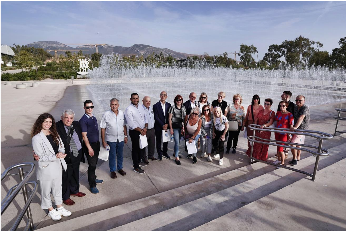
Technical Visit at the Ellinikon Experience Park