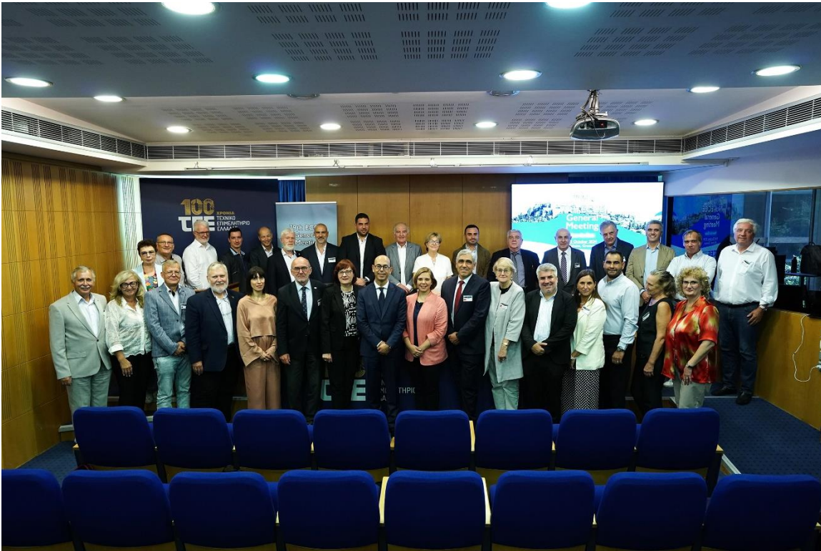
Participants at the 79 th ECCE General Meeting