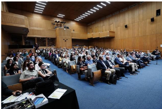
The BIM Conference: BIM beyond 101

Alongside the 79 th ECCE General Meeting, the “ BIM Conference: BIM Beyond 101 ” was held on 9 th October 2024, at the Eugenides Foundation in Athens. The event was hosted by the Technical Chamber of Greece and BOUSSIAS, a leading B2B communication company.